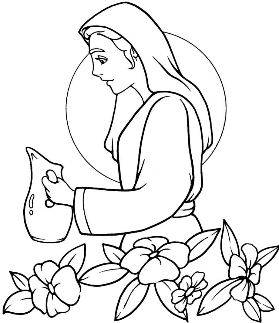
A Bride for Isaac Genesis 24:1-67